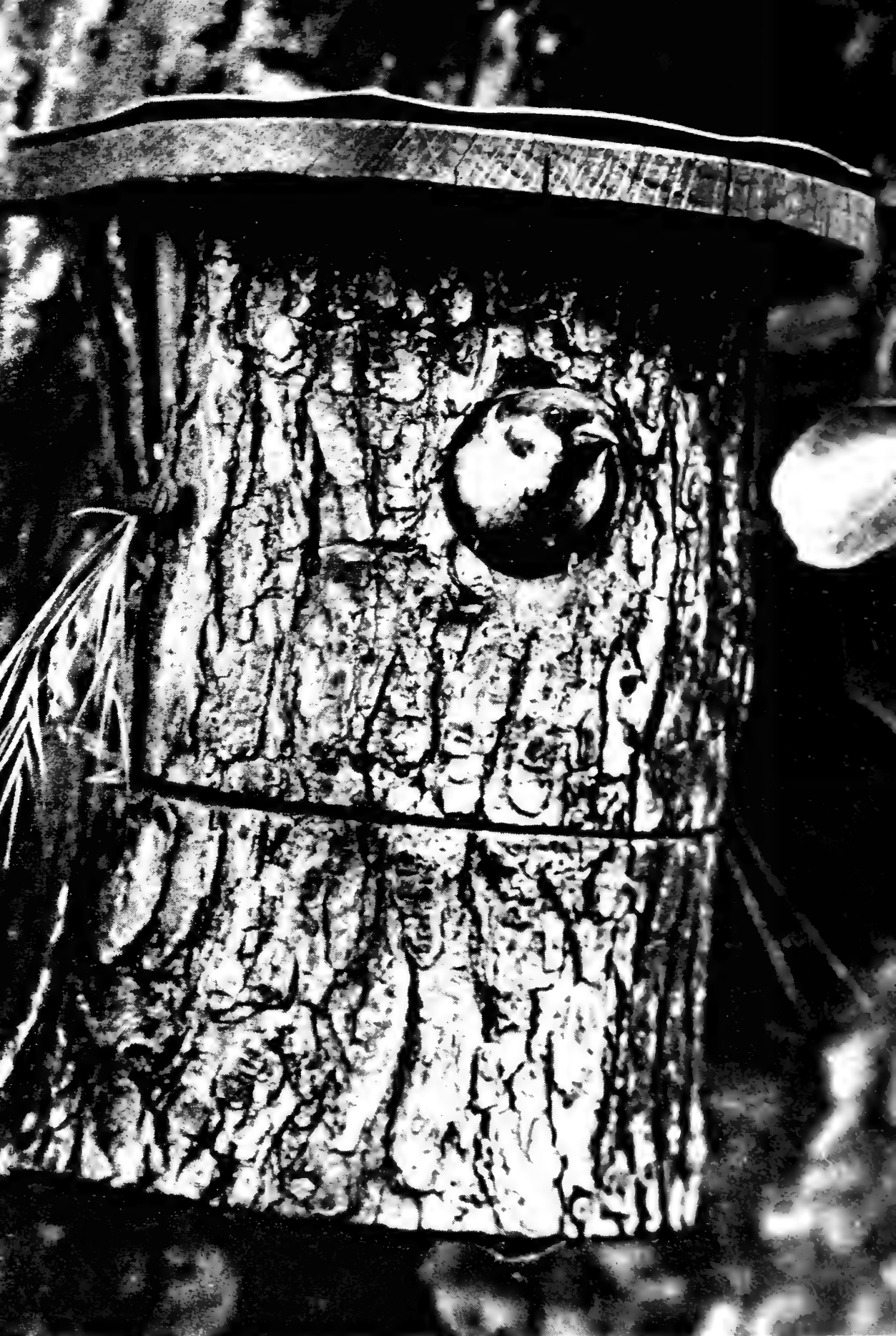
PLATE 2. TREE SPARROW Passer montanus (F. H. S. G. FRPS)